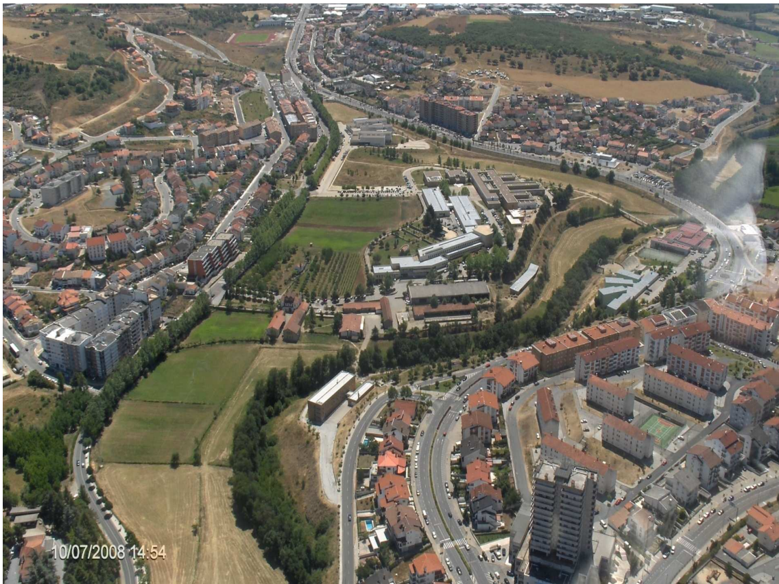
Polytechnic Institute of Bragança, Saint Apolónia Campus

International students without mobility grants can also use the Social Welfare restaurants where they can have a complete meal for 2.30 Euros, including soup, main course (either fish or meat) and dessert.